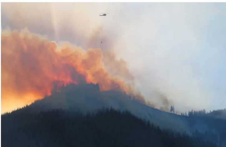
1500 Road Fire, Oregon 2007

These meetings are open to the public and will include slideshow presentations by wildfire specialists and local personnel working to develop the plan.