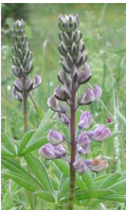
Kincaid's lupine

If you volunteer to have your property surveyed for the HCP, and your property is selected for surveys this year (2007) field biologists will contact you in April to schedule a visit to your property. All sites will be visited by a botanist (biologist specializing in plants), and depending on the type and quality of the habitat at your property, your property may also be surveyed by lepidopterists (biologists specializing in butterflies) or ornithologists (bird specialists). Property owners are welcome and encouraged to join the biologists as conduct assessments.