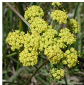
Bradshaw's lomatium

The habitat data and any rare species data collected at your property will be provided to you once it has been compiled, usually in late summer. The data also will be entered into a database maintained by Benton County. The data will be available for limited use by organizations, agencies, and researchers doing work to benefit these species and habitats. Such agencies include the Oregon Natural Heritage Information Center and the US Fish and Wildlife Service.