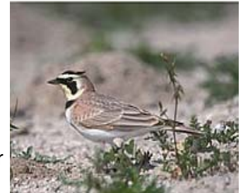
Streaked Horned Lark

the HCP, the biologist will compile a list of plant species in prairies on the property, write a brief habitat description, and note any problematic aggressive weedy species that are present, such as false brome or Scotch broom.