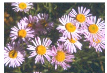
Willamette daisy

Notice the change? We changed the Benton County HCP name from the Multi-Species HCP to the Prairie Species HCP, which is easier to refer to, remember, and more specific.