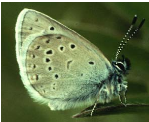
Fender's blue butterfly

Benton County is interested in surveying property of willing private landowners that has the potential to support the species covered by the HCP (see below for a list)- this includes lands that currently are or were historically upland prairie, wet prairie, or oak savanna.