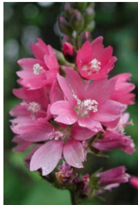
Nelson's Checkermallow

The County is conducting surveys because it needs to learn where these species are located, the habitat the species depend on, and how many individuals of these rare species there are in the County. Even if these species are not present on a piece of property, the County is still interested in examining examples of high quality native habitat, to provide critical information for habitat restoration.