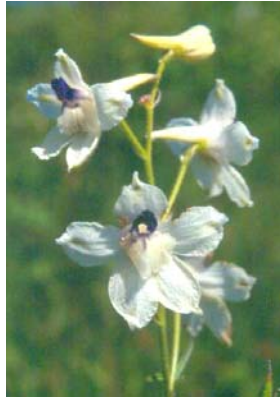
Peacock larkspur

April through mid- July. Re-requesting a species survey does not guarantee that we will be able to visit your property in 2007 or 2008. Properties will be selected for survey based on the likelihood that the species and habitats that the HCP is focused on are present on your land. You will be contacted in April of 2007 if your property is selected for survey this year.