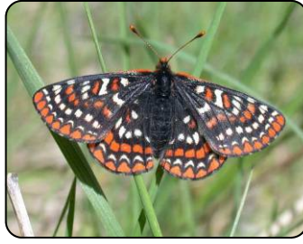
TAYLOR'S CHECKERSPOT Known populations in Benton

The purpose of the Habitat Conservation Plan is to describe how the County will balance species conservation with home, farm and forest construction, public lands management and essential public services. The HCP describes how the County will avoid, minimize, and mitigate impacts to threatened, endangered, and critically rare prairie species in the County. By planning in advance, the County can design and modify projects (e.g., road maintenance) to avoid or minimize impacts to the species, and complete any needed mitigation in advance. The HCP establishes mechanisms for collaboration between Benton County, the Cooperators (see box), and private landowners, ensuring that any restoration of rare prairie species populations is conducted where it will contribute the most to the conservation of the species. Through the HCP, Benton County and Cooperators will develop a network of conservation sites throughout Benton County (see Conservation Area Map on back page).