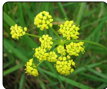
BRADSHAW'S LOMATIUM Known populations in Benton County: 3 Populations on Public Lands: 1

The draft HCP proposes to make the permit application process more efficient for private landowners by coordinating and completing biologically meaningful mitigation in advance. The County will acquire conservation easements over important butterfly habitat and enhance that habitat over time. The County proposes sharing the enhancement costs with landowners requesting building permits in butterfly habitat.