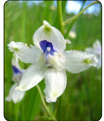
PEACOCK LARKSPUR Known populations in Benton County: 18 Populations on public lands: 14